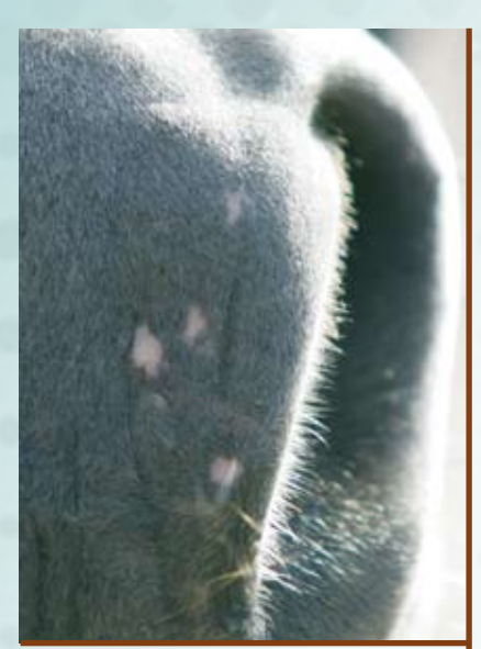
Depigmentation may wax and wane, but complete remission may occur rarely