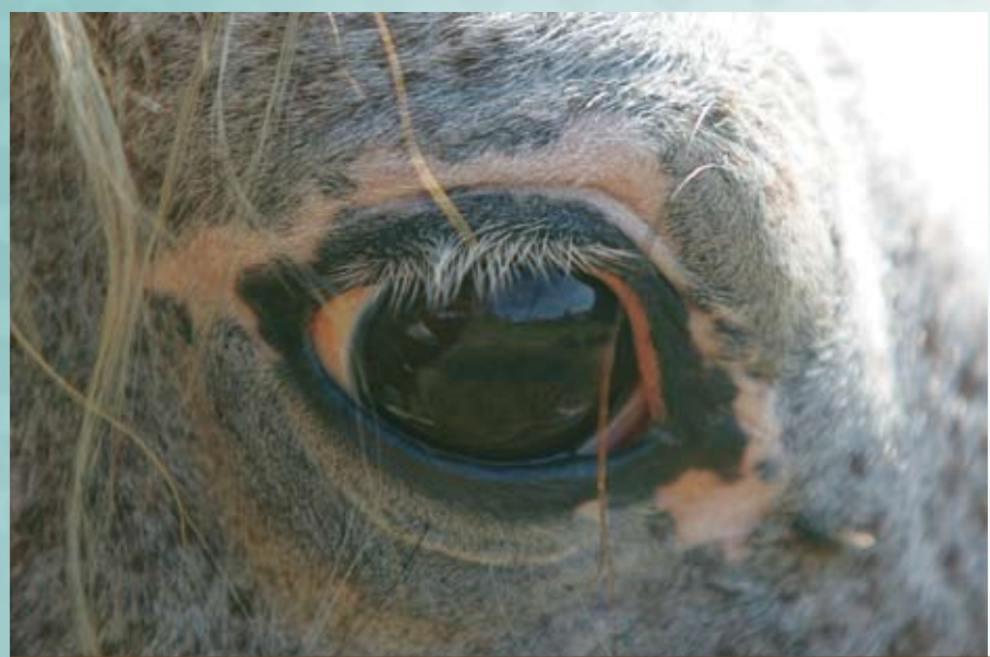
Grey Arabian horses are prone to develop skin depigmentation